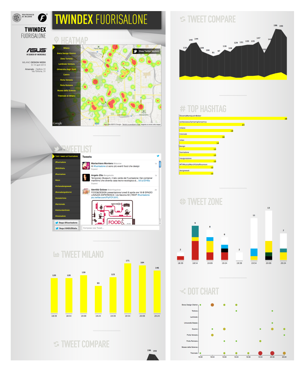
Fig. 2: The mashup published on the official Fuorisalone website by Studiolabo.