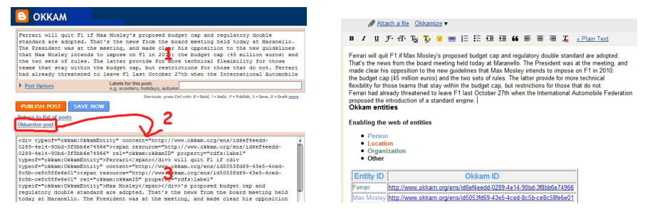
Fig. 2. Semantic annotation of entities via Fig. 3. The Okkam4Gmail extension for the Okkam4Blogger extension. annotating named entities in emails.

Okkam4Blogger is a web plugin for the free blog application Blogger<sup>14</sup> from Google. Before posting a new document, the user can press the "Okkamize post" button (see Fig.2). The extension identifies precisely and automatically entities by means of a thorough processing and linguistic disambiguation, which includes morphological, grammar, syntactic and semantic analysis of the text. All fundamental information for the disambiguation process, i.e. the whole system knowledge, is represented as a concept-based semantic network. Expert System's semantic network, called Sensigrafo<sup>15</sup>, is a rich conceptual representation of the