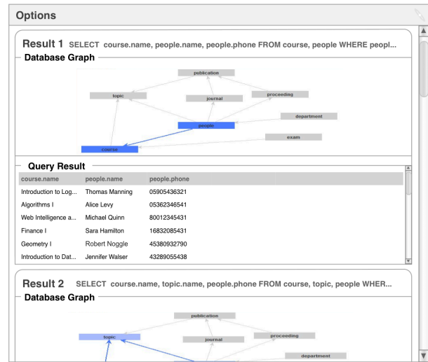
Figure 2: The QUEST user interface.

There are five main messages we intend to communicate to the audience through this presentation. First, we will demonstrate that